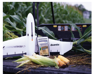
Quantix™ & AV DSS™

An Agronomist with Cottonwood Co-op Oil Company (MN), Ashley brings over 16 years of agronomy experience across fruit trees, vegetables, row crops and Precision Ag.